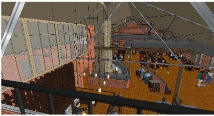
REMINGTON RAND RESTAURANT PROPOSAL Restaurant from Loft Office Space